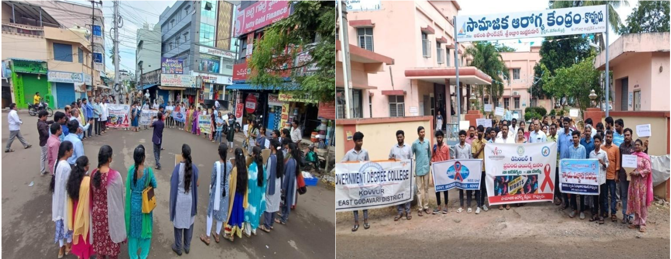
World AIDS Day Observation — Dec 1st

World AIDS Day is observed on 1st December every year. At GDC Kovvur, all staff members and students participated in a rally to create awareness among the public about HIV/AIDS prevention and support.