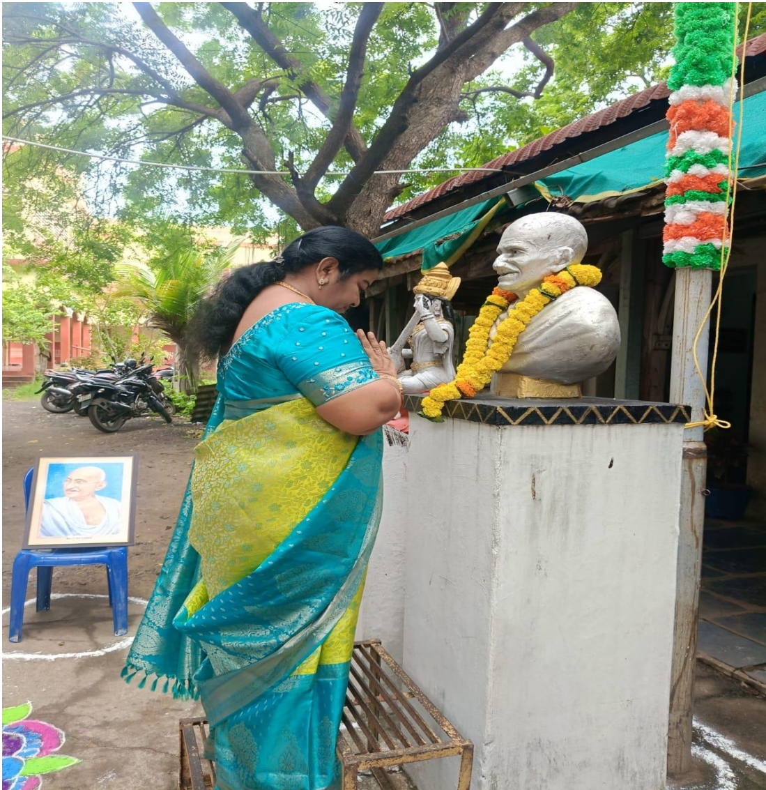
Gandhi Jayanthi Observation — Oct 2nd

Our College observed Gandhi Jayanthi on October 2nd. Gandhi Jayanti is a national holiday in India, recognized globally as the International Day of Non-Violence. It honors Mahatma Gandhi's legacy of peace, non-violence (Ahimsa), and Satyagraha, fostering a culture of harmony.