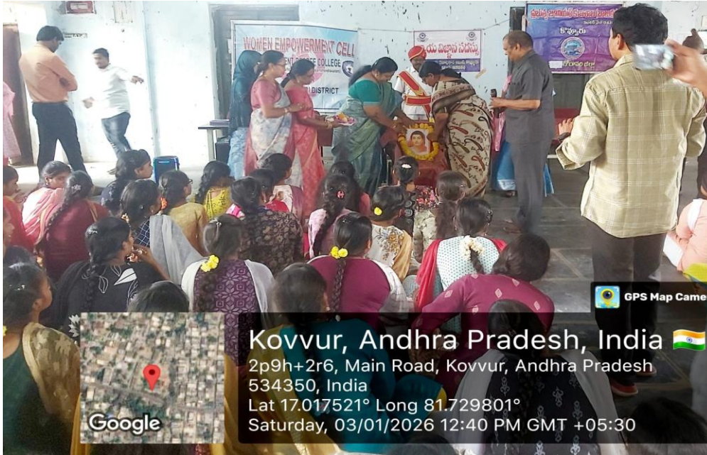
SavitribaiPhule Birth Anniversary — Jan 3rd

Savitribai Phule's birth anniversary, celebrated annually on January 3rd, honors India's first female teacher and pioneer of women's rights, education, and social reform. The programme started with opening remarks by the Principal, followed by a floral tribute to her photograph.