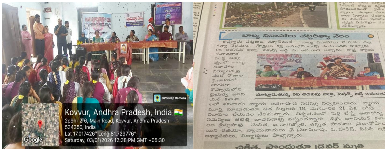
Child Marriage Awareness Programme — Jan 3rd

An Awareness Programme on Child Marriages was conducted on 3rd January 2026 to educate students. The District Judge was invited as the Speaker. The Principal, Teaching, Non-Teaching, and Students all participated.