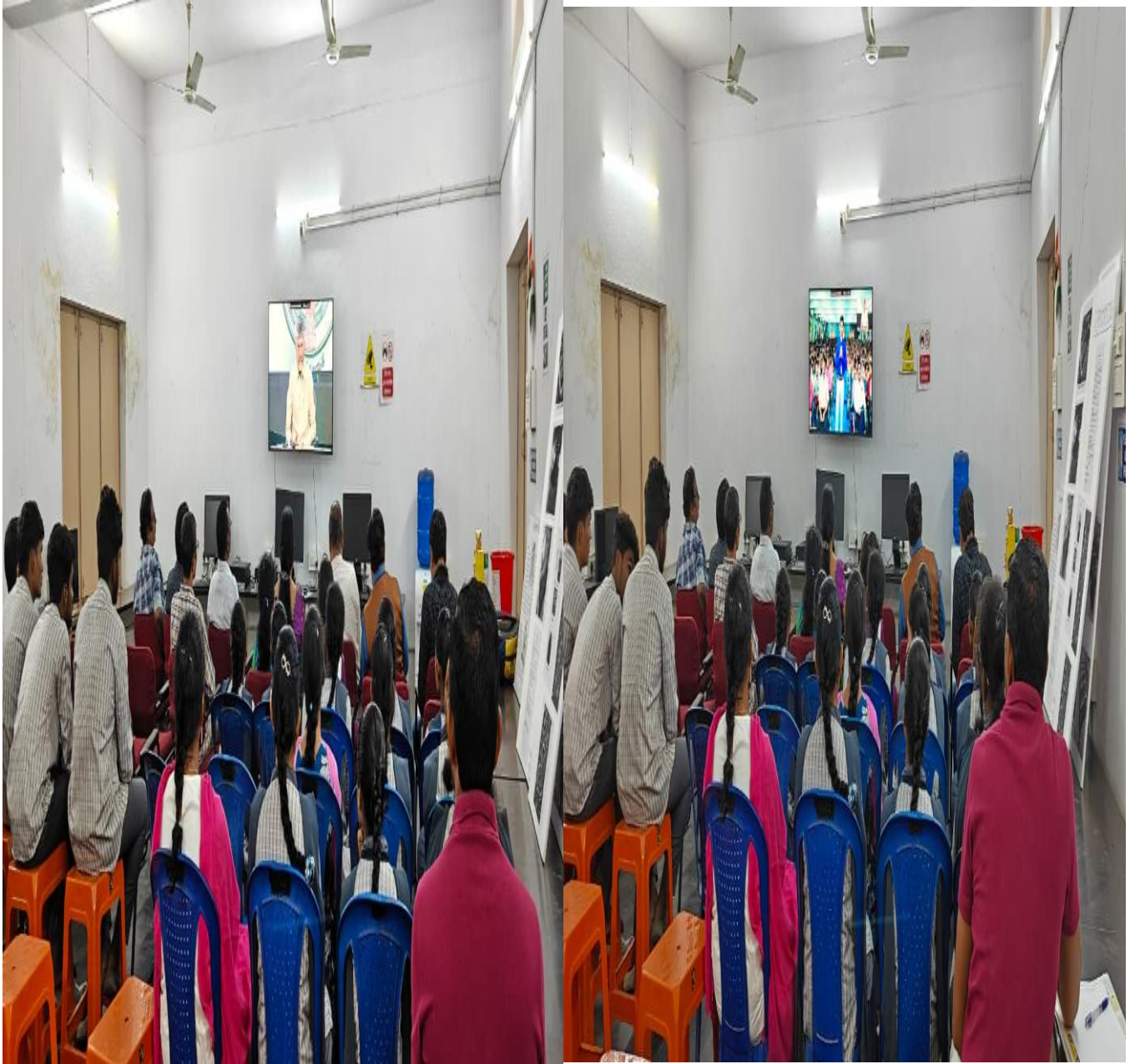
CM Video Conference on Quantum Technology — Dec 23rd

The Chief Minister of Andhra Pradesh conducted a video conference with students of all Government Degree Colleges on 23-12-2025 on the importance of Quantum Technology. The Principal, staff, and students participated enthusiastically.