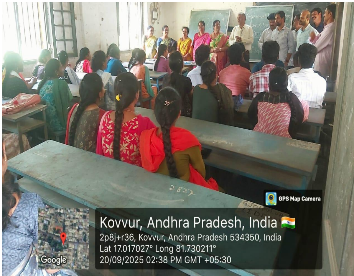
Induction Classes for First Year Students

Induction classes were conducted by lecturers of different departments for 10 days for all first-degree students. These established clear expectations, built confidence, improved long-term performance, and reduced initial anxiety among new students.