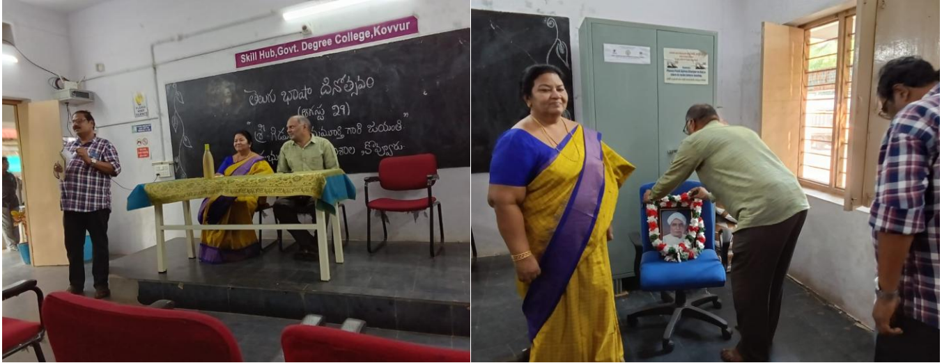
Telugu Language Day — Aug 29th

On 29th August, GDC Kovvur observed Telugu Language Day to honor the birth anniversary of Sri Gidugu Venkata Ramamurthy, a pioneering linguist and social reformer. All staff and students participated in the programme.