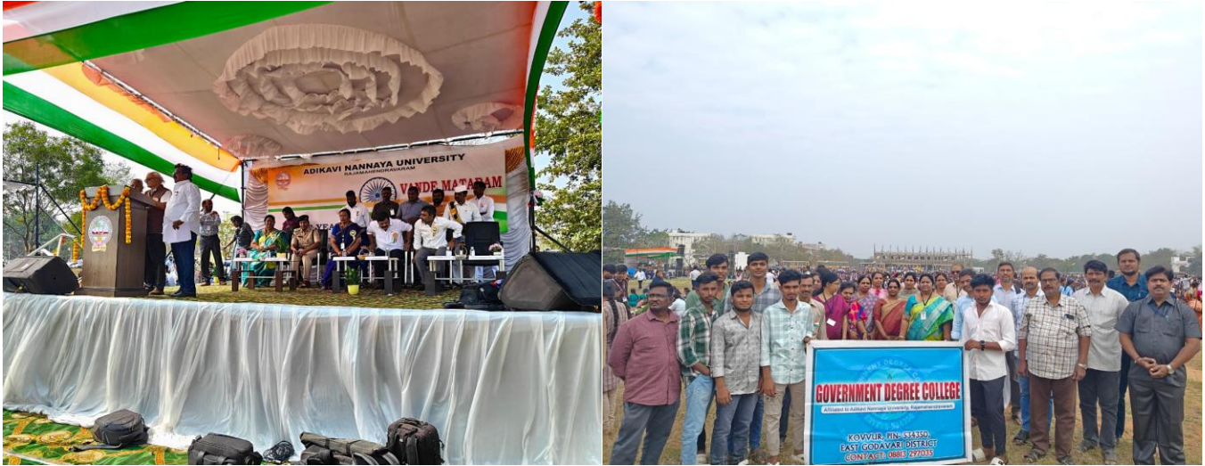
VandeMataram 150th Anniversary — Jan 24th