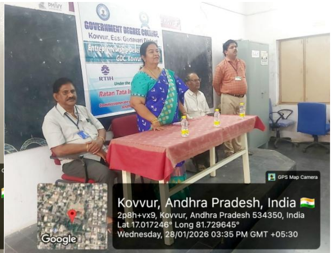
EDC Inauguration — Jan 28th