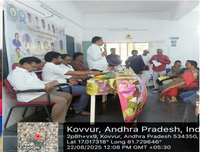
Job Mela — Aug 22nd