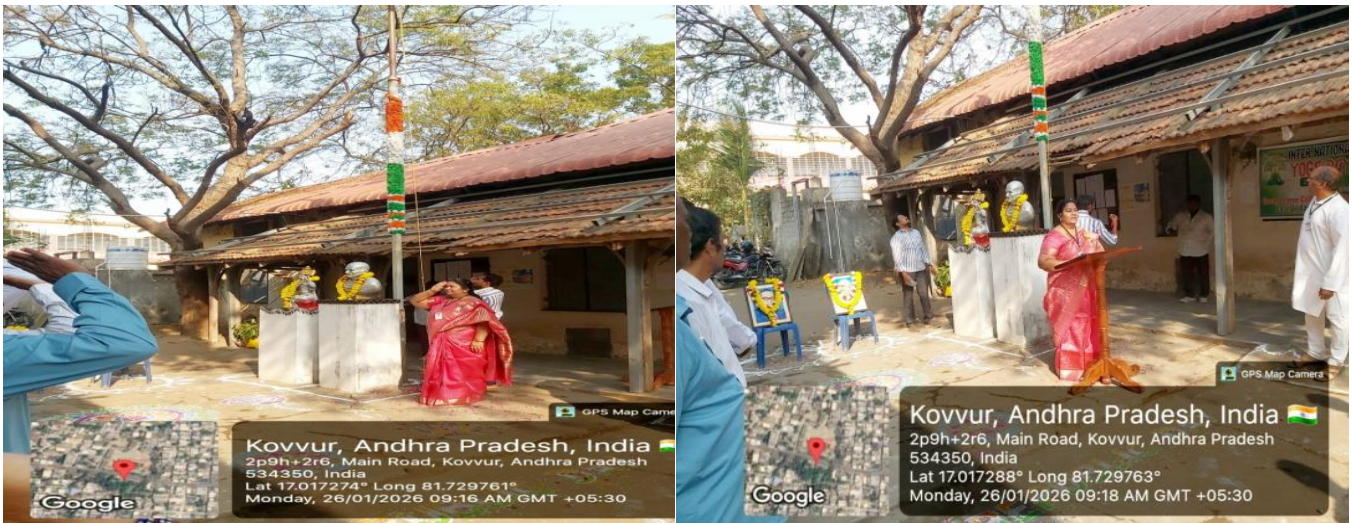
Republic Day Celebrations — Jan 26th

Republic Day was observed on 26th January 2026. The Principal unfurled the Indian National Flag and addressed students on the importance of Republic Day. Certificates were issued to students who participated in various activities.