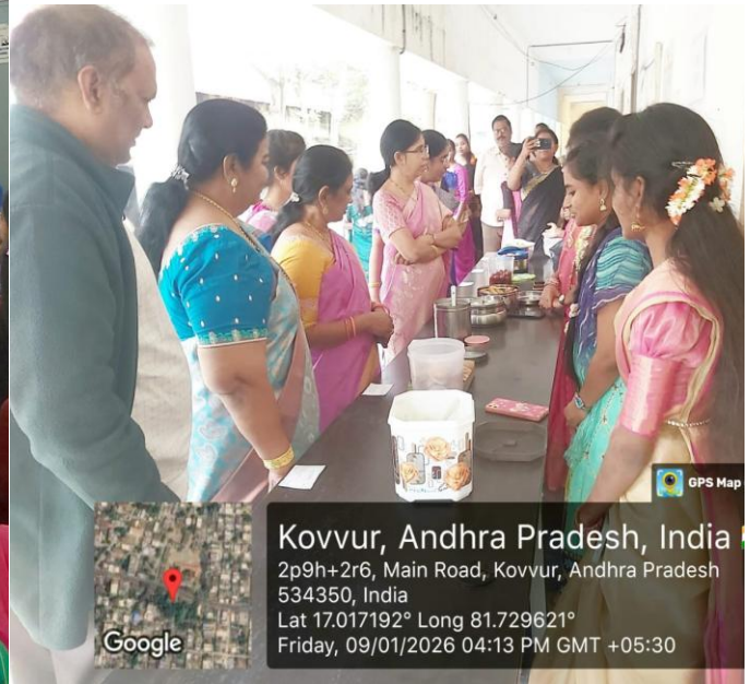
Food Fest & Traditional Dress Competition — Jan 9th