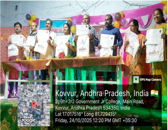
Fresher's Day Celebrations — Oct 24th