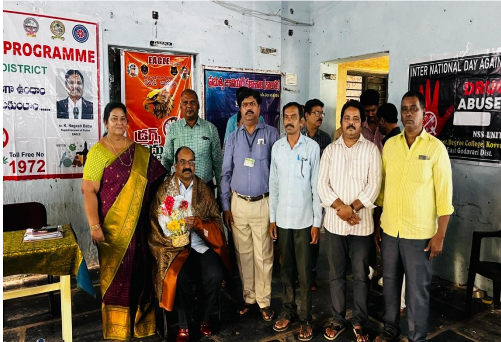
Anti Drug Awareness Day — Aug 11th

GDC Kovvur observed an Anti Drug Day on 11th August 2025 to create awareness among students about the dangers of drug abuse. The programme started with opening remarks from the Principal. All staff and students actively participated.