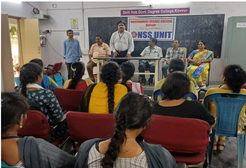
NSS Day Celebrations — Sept 24th

NSS Day is celebrated on 24th September to commemorate the 1969 launch of the National Service Scheme. It promotes the motto 'Not Me, But You,' with colleges conducting social service activities like blood donation camps, tree plantations, cleaning campaigns, and cultural programs to foster youth community service.