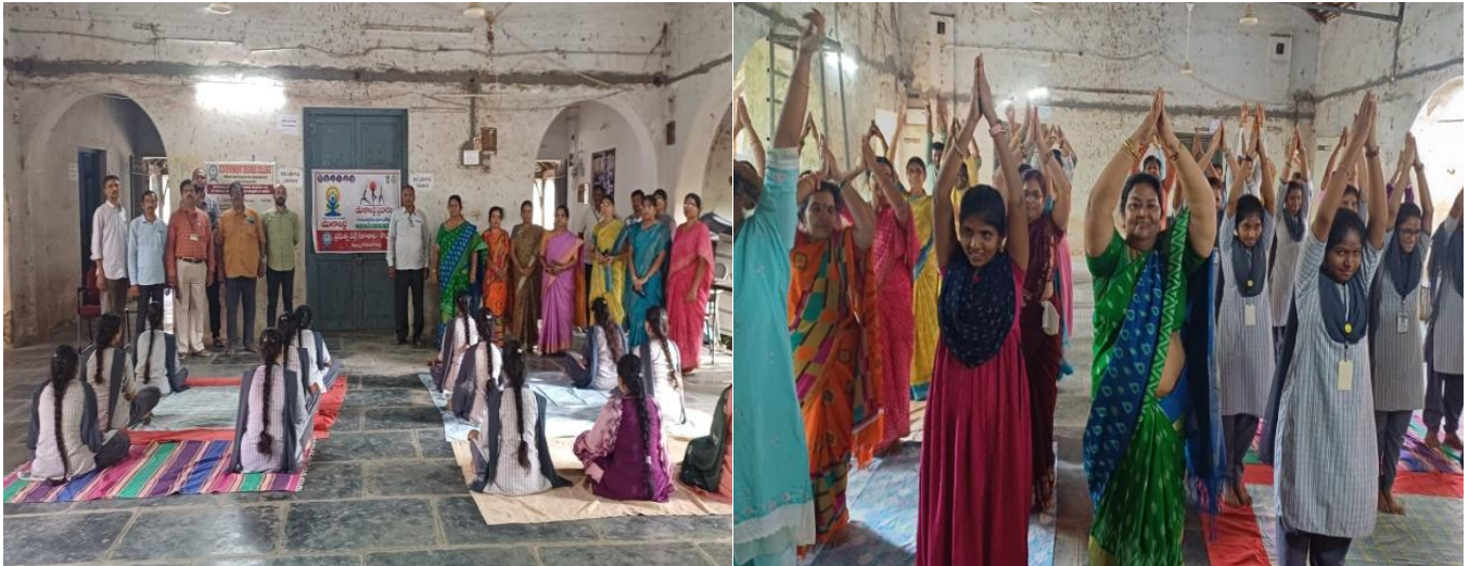
International Yoga Day Celebrations — June 20th