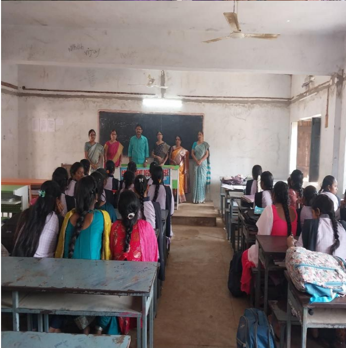
Online Admissions Campaign 2025