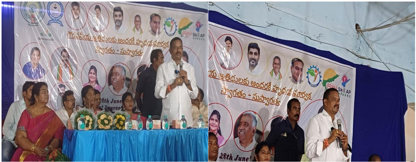
Mega Job Mela — June 28th