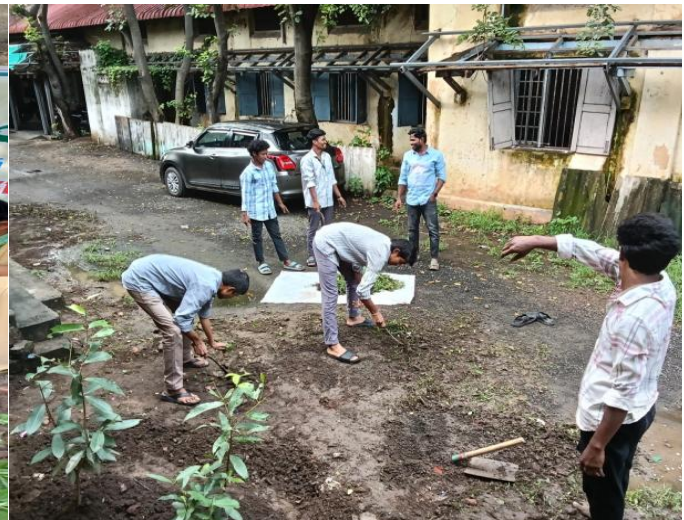
Swachh Andhra Programme — Aug 23rd