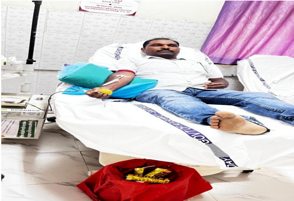
World Blood Donor Day — June 14th

World Blood Donor Day (WBDD) is celebrated on June 14th every year to raise awareness of the need for safe blood and to thank blood donors. June 14th is the birthday of Karl Landsteiner, who discovered the ABO blood groups in 1901 and helped identify the Rhesus factor in 1937.