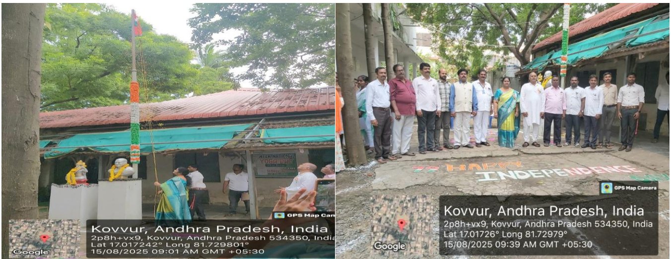
Independence Day Celebrations — Aug 15th

GDC Kovvur observed Independence Day on 15th August. Principal Madam hoisted the flag and delivered an inspiring address. Prizes and certificates were distributed to students who participated in Essay Writing, Elocution, Sports, and Patriotic Song competitions.