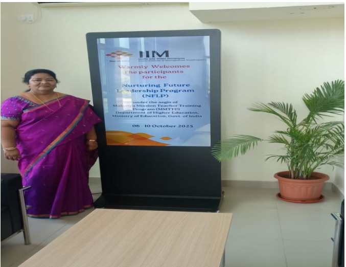
IIM Visakhapatnam — Future Leadership Program