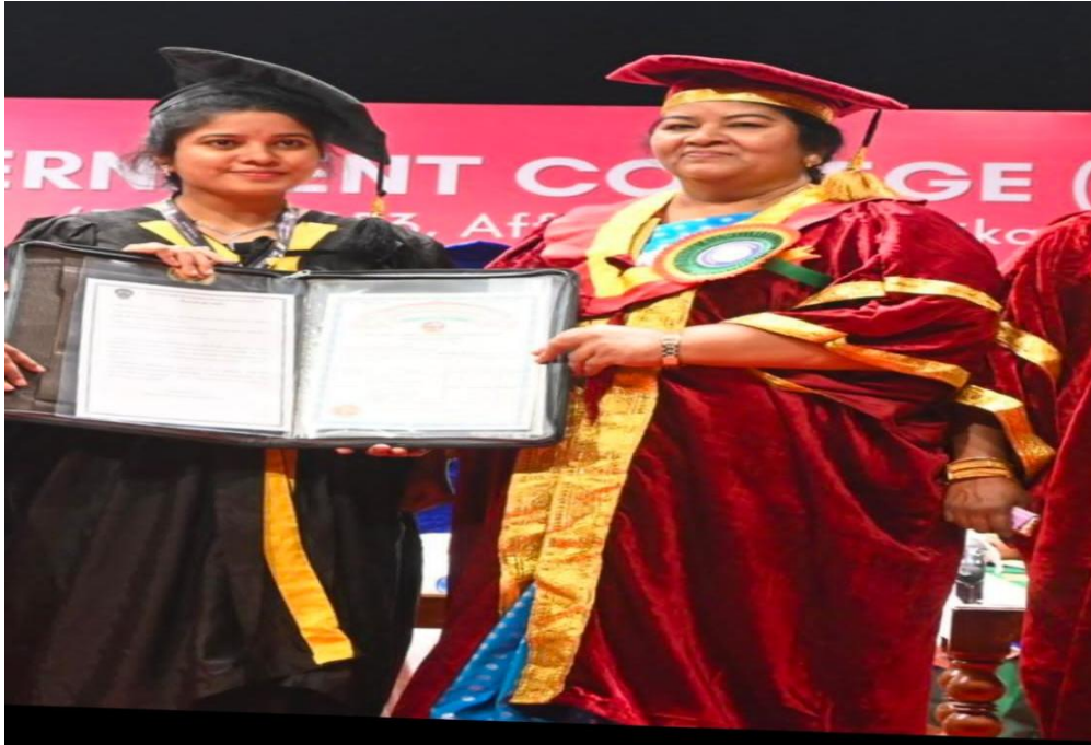
Graduation Day — GDC Rajahmahendravaram

The Graduation Day celebration took place at GDC Rajahmahendravaram on 07-11-2025, for which the Principal was invited as the special guest — a proud recognition of her stature and contribution to higher education.