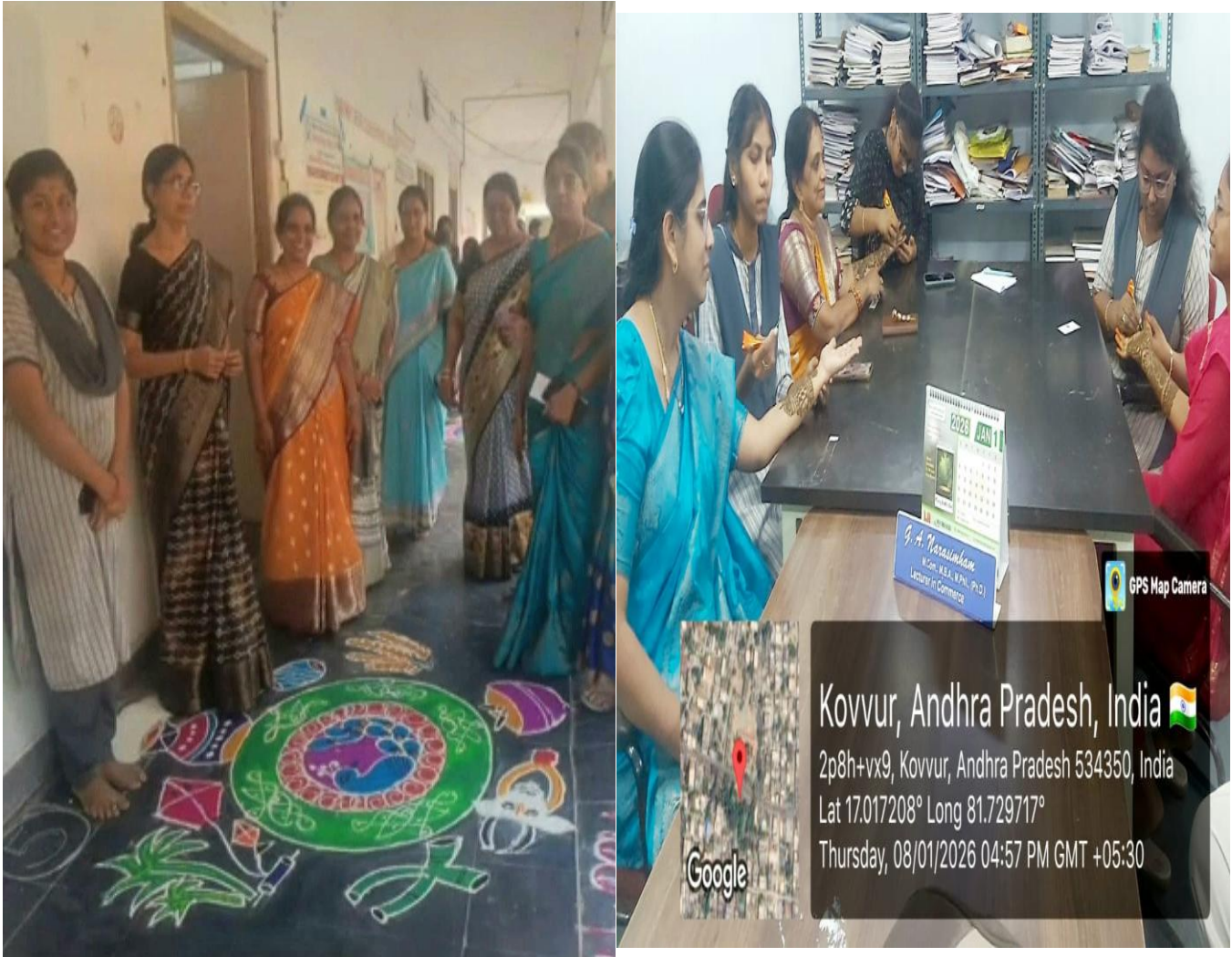
Rangoli & Mehendi Competitions — Jan 8th

Rangoli and Mehendi Competitions were conducted on 8th January 2026 by the Women's Empowerment Cell (WEC) on the occasion of Sankranti. Students participated with enthusiasm and prizes were given to winners.