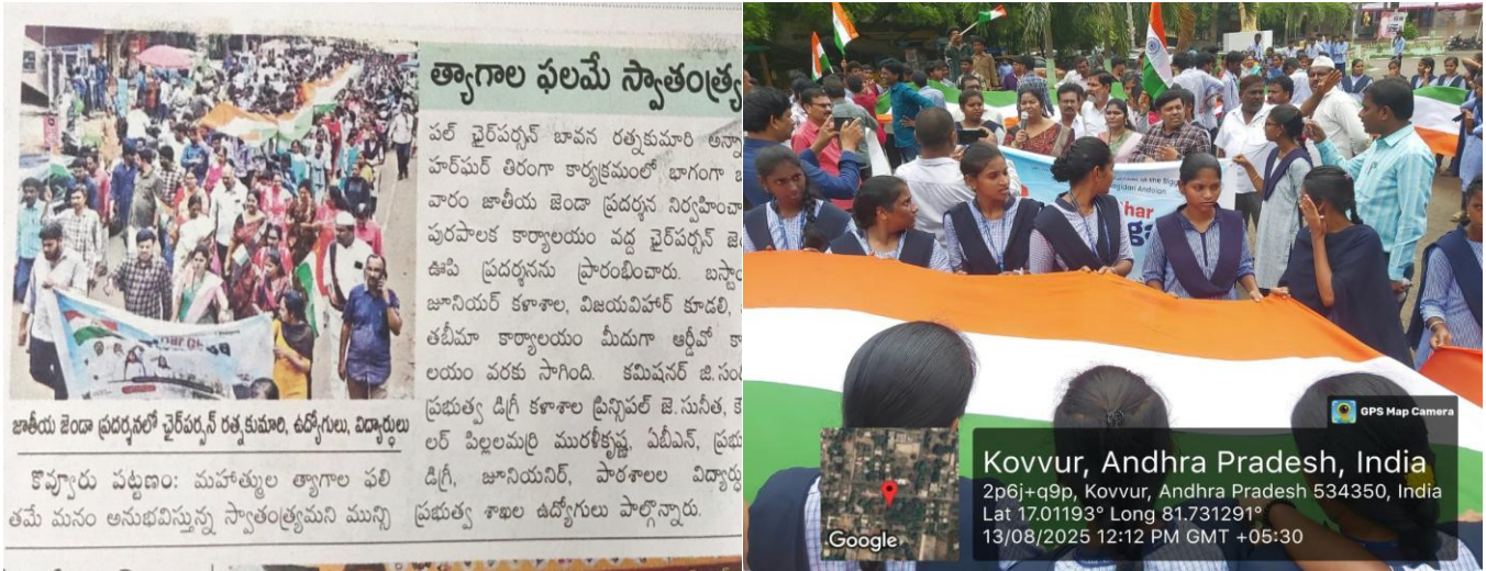
HarGharTiranga Rally — Aug 13th

The HarGharTiranga Rally is a patriotic procession held to encourage citizens to hoist the Indian Flag at their homes, fostering national pride and unity as part of AzadiKaAmritMahotsav. The Principal, staff, and students of GDC Kovvur participated in the rally.