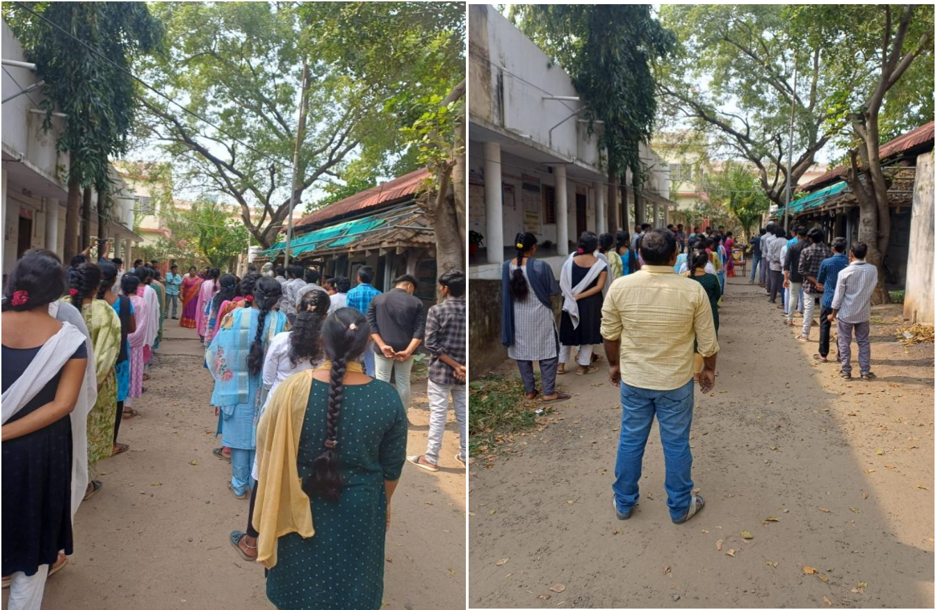
National Constitution Day — Nov 26th

National Constitution Day was observed at GDC Kovvur on 26-11-2025. The Principal, teaching and non-teaching staff, and all students gathered at around 11am. The Principal addressed students on the importance of the Constitution's values and objectives. All staff and students then read the Preamble of the Indian Constitution.