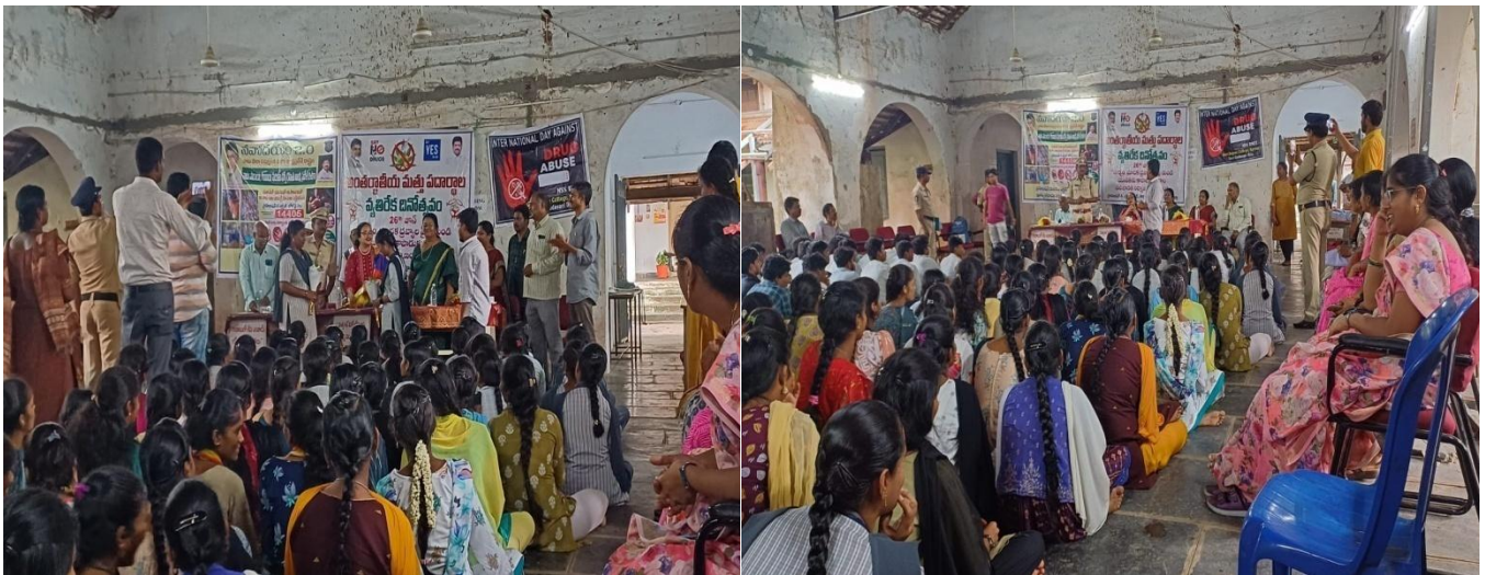
Anti-Drug Awareness Program — June 26th