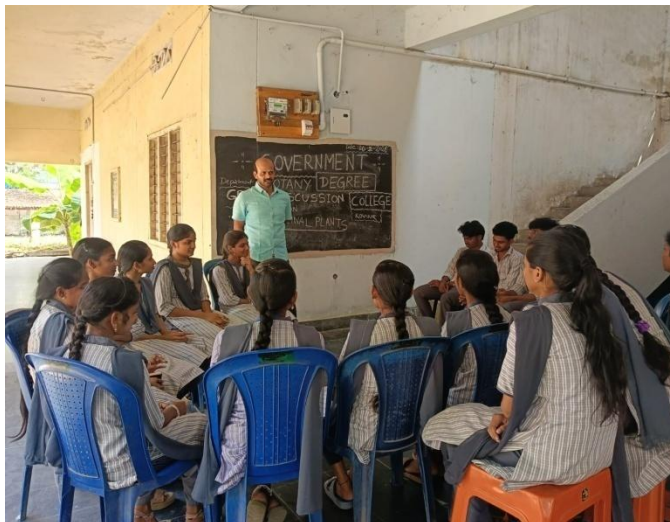
Group Discussion Sessions